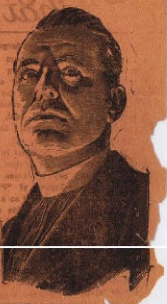
PAT O'BRIEN as Connelly in "Angels With Dirty Faces."