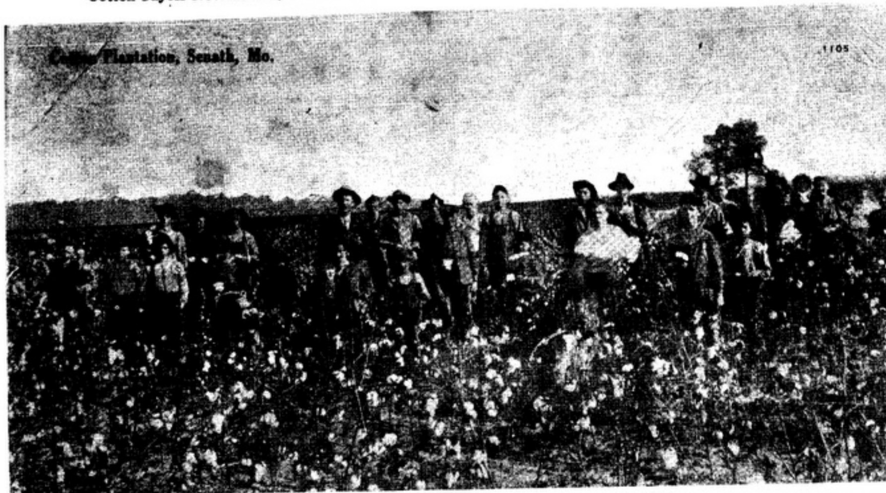
This picture postcard was mailed to Byrds, Mo. June 12, 1911.