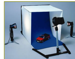
Photo Studio in-a-box. Provides desired tools to photograph documents indoors.