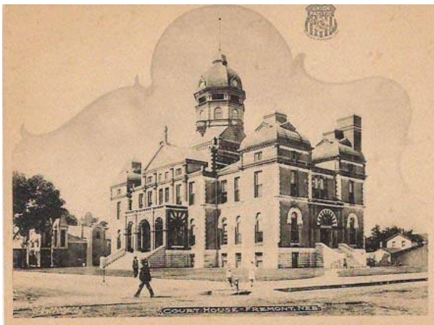
The Dodge County Courthouse in Fremont, dedicated October 4, 1890, replaced an older brick structure in use in 1884 during the county seat removal controversy.

Apparently the voters of Dodge County agreed with the Herald . They voted on September 9, 1884, to retain the county seat at Fremont by some 1,800 votes out of 3,000.