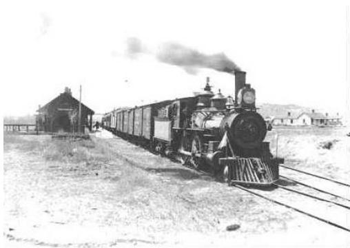
The Fremont, Elkhorn and Missouri Valley Railroad about 1905

“A school building was moved from the country east of Crowell in 1886. It was originally built in 1873, north of Pioneer Choe's farm property, on NE of Section 2.”